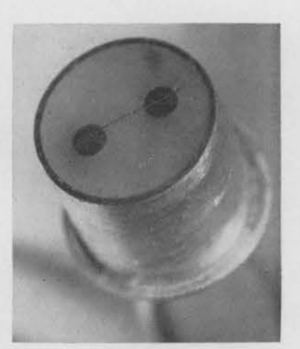
SAMPLE of ultrasonic welding above shows tiny .0008 inch nickel alloy bridgewire joined to Kovar posts .040 in diameter.

welding process seems particularly applicable and promises a high degree of reliability."